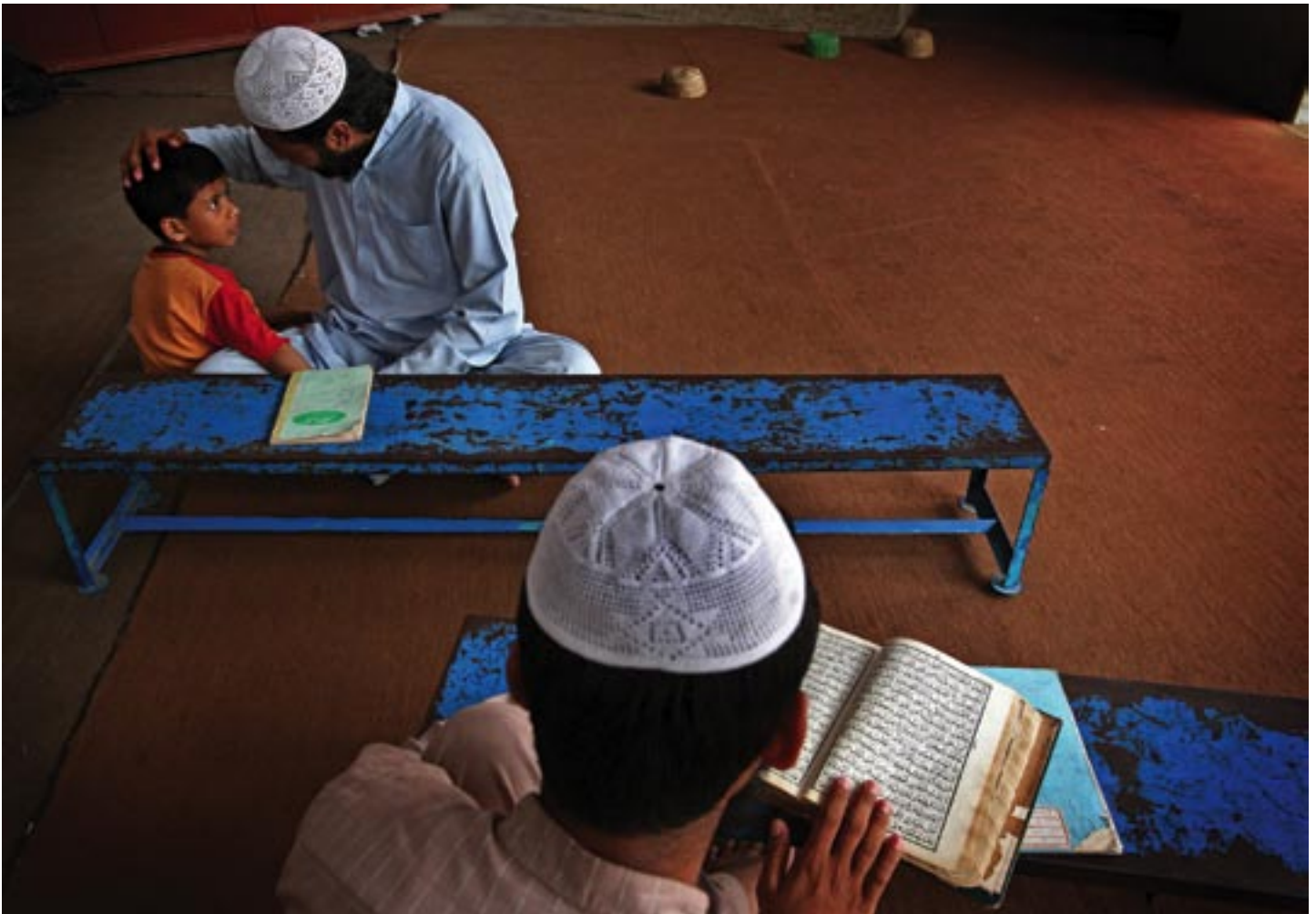
A child learns from an older student as they study the Koran at the Jamia Naemia madrassa in Lahore, Pakistan. Each year, thousands of children attend these religious schools which have been accused of breeding Islamic extremists.

“The Pakistanis I met were unhappy with the current U.S. policy toward Pakistan and the Middle East. They also professed their love for Hillary Clinton, primarily because she was married to former President Bill Clinton, whose foreign policy they had respected.”