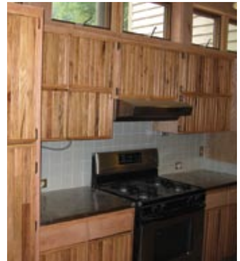
Wood for kitchen cabinets in the EcoDorm was harvested from the College Forest.

Professors and students from many disciplines work closely with departments such as landscaping, natural resources, the farm and the garden to bring their academic knowledge of sustainable practices out of the classroom and into the field. "Many of the students on the forestry crew are in forestry classes, so they get to see it from both the academic standpoint and the practical application," Swartz said.