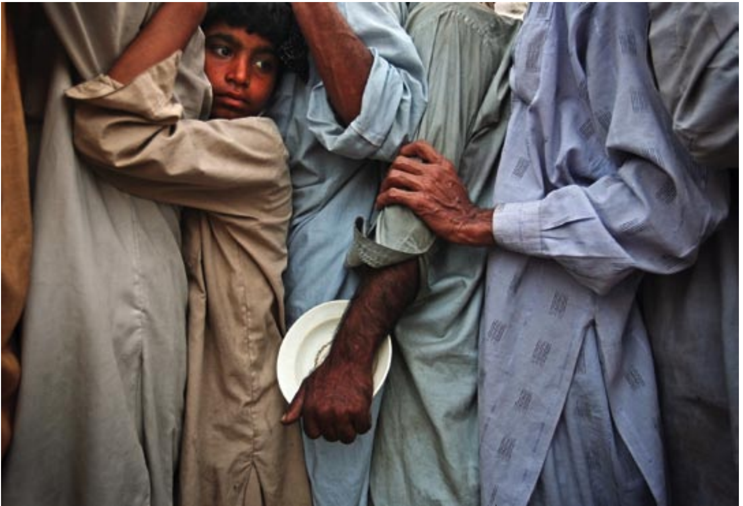
A homeless boy stands among men in a food line on a street outside of a Lahore mosque during the holy month of Ramadan. Over a quarter of the Pakistan population lives below the poverty line.

The streets were bustling: children cooled off in the canal; women in richly colored salwar kameezes (loose-fitting pants and tunic) bought bright oranges and pomegranates from donkey-pulled carts; men rode old-fashioned bicycles.