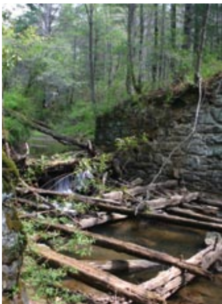
Bull Creek dam ruins