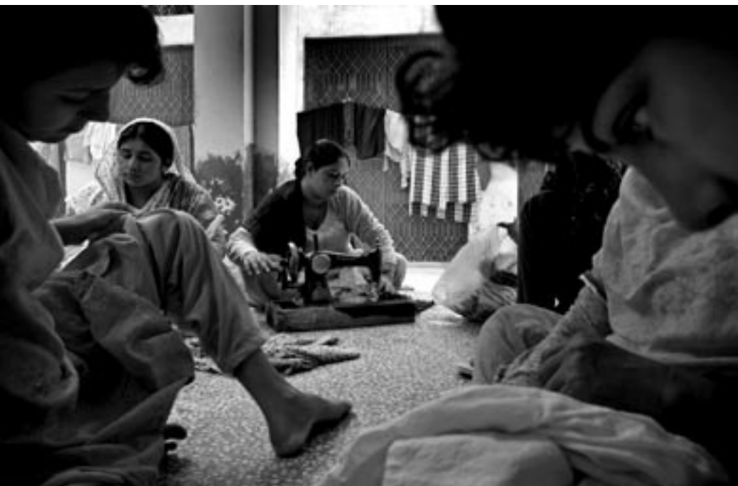
Women seeking refuge in a Darul Aman, or women's shelter in Lahore, Pakistan, practice their sewing and embroidery skills. Having relied on their husbands or families their entire lives for income, the women are required to gather each morning to learn vocational skills in hopes that once they leave, they can be self-sufficient.

In the end, it was difficult to leave Pakistan. Yes, there was the ever-present possibility of being bombed or kidnapped, and there were plenty of times when I felt afraid and nervous. But these difficulties were eclipsed by moments of awe and utter joy: drinking tea and laughing with new friends in a refugee camp in Kashmir, learning how to cook traditional bread in the shelter, and visiting bustling markets in the cities. Most important, at least to me, was that my experiences in Pakistan and the stories and photos we captured there had the potential to bridge cultures and to truly make a difference. It is this potential to make a difference that drives my work as a photojournalist.