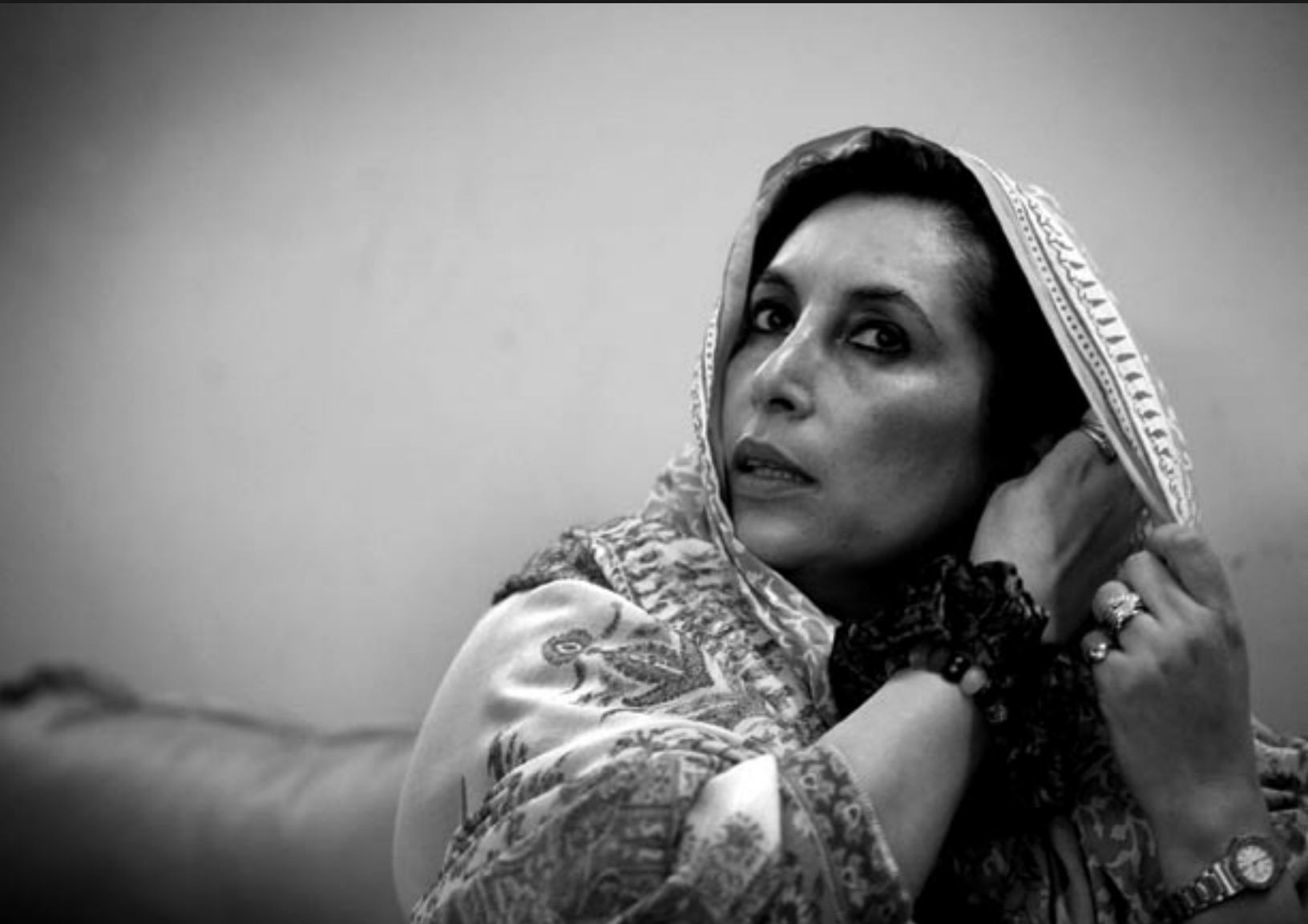
Benazir Bhutto, in the days preceding the assassination

The Alumni Magazine of Warren Wilson College SUMMER 2008