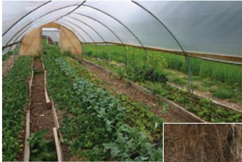
Vegetables and salad greens for the cafeterias are grown in greenhouses at the College Garden, and meat is produced at the College Farm. Unused food and other materials are collected for composting in the Green Drum, a rotating compost system (bottom).

Classes also benefit from the presence of the garden and the farm and give back to them in turn. For example, students in one of Professor David Abernathy’s global studies courses have been measuring soil moisture levels and ambient temperature at various locations in the garden. Their research will help the garden practice more effective irrigation and gauge relative humidity, which should help in controlling plant diseases.