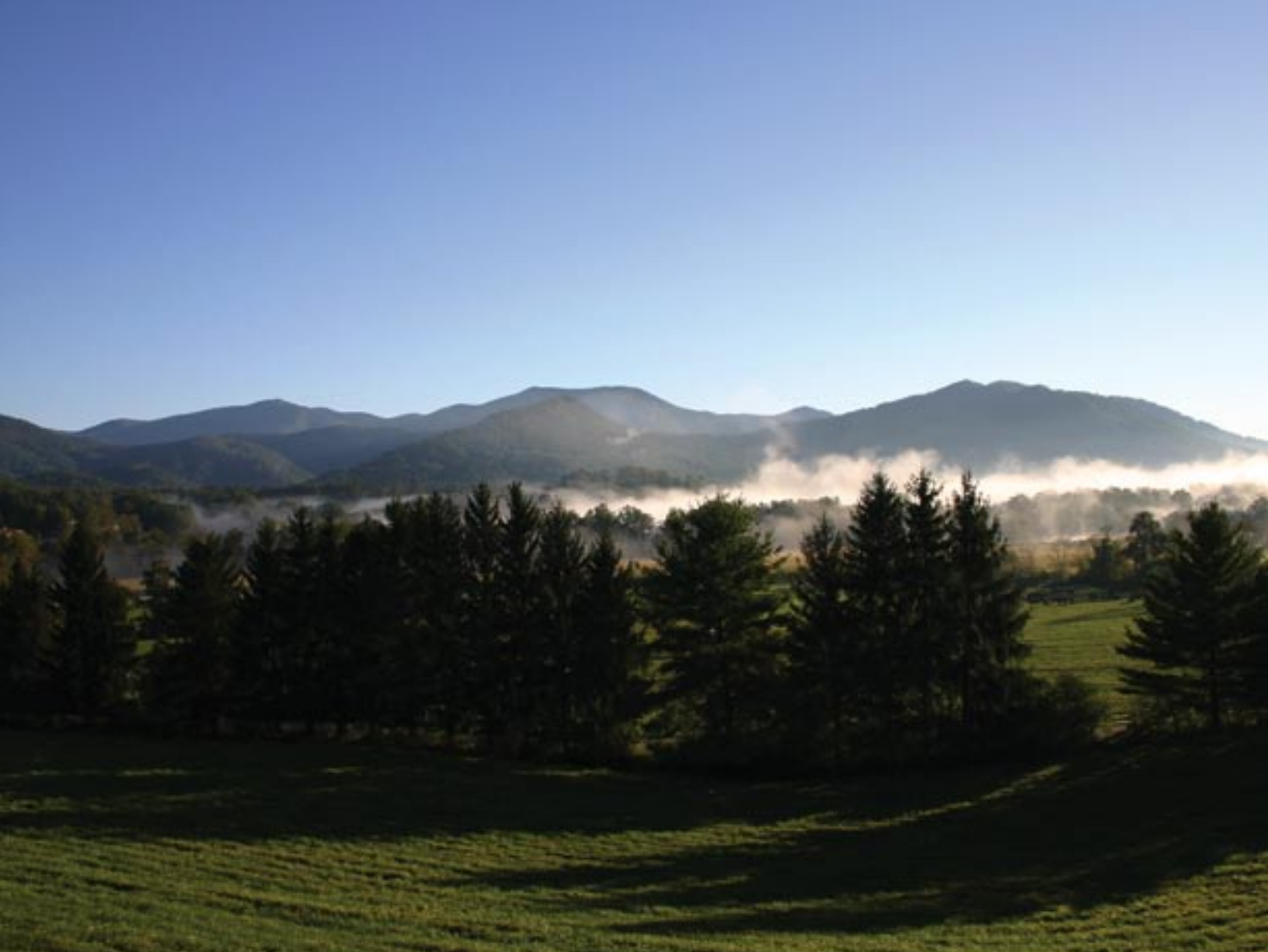
Sunrise from College View