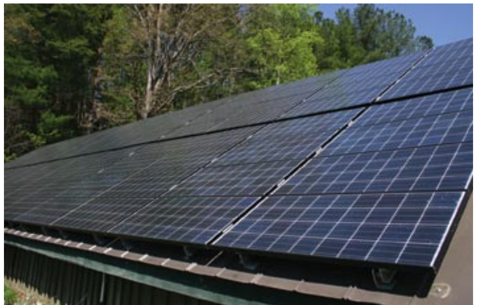
This solar array is used to charge the College’s fleet of carts, which are used by many work crews on campus. Excess energy created by the array is sent upstream and used by the local power company.