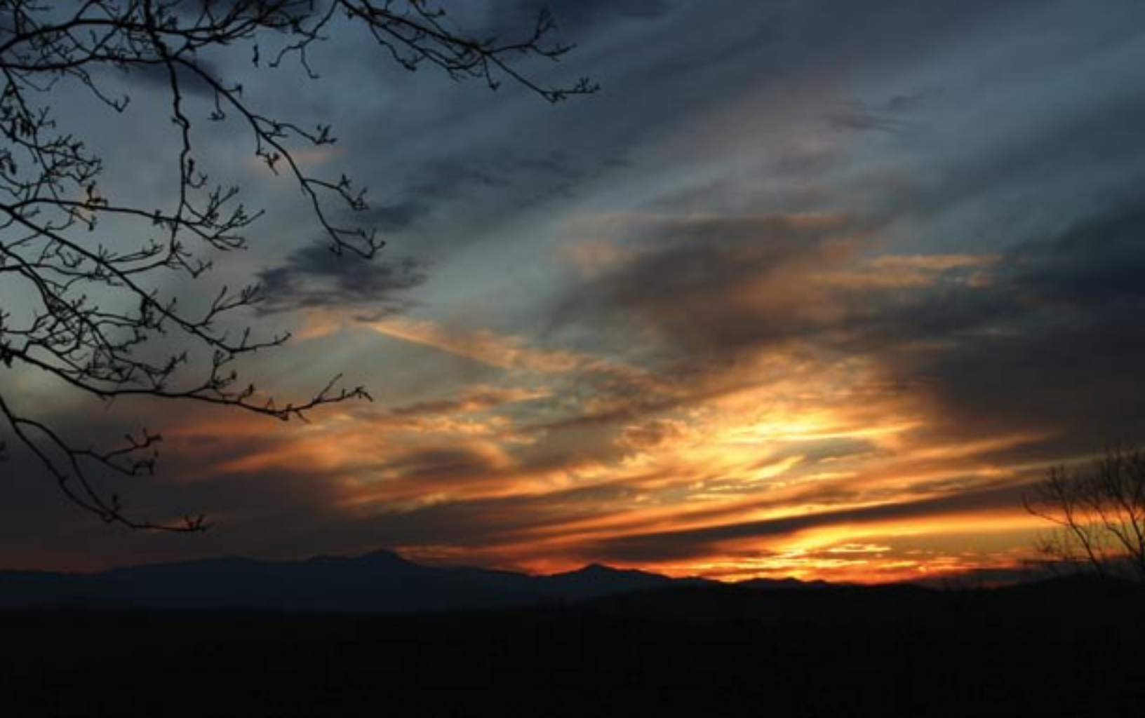
Sunset from Dogwood