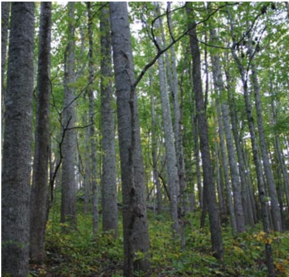
The forestry crew practices "thinning-from-below," removing undesirable trees and encouraging the growth of larger native hardwoods and native understory.

The landscaping crew also strives to do what is best for the ecosystem by planting native species, designing landscapes that are wildlife-friendly and decreasing lawn areas. The landscapers also reduce their impact on the environment with steps like converting mowers to propane, using biodiesel, and using biodegradable, soy-based oil lubricants for machinery. In 1998 the landscaping crew participated in a U.S. Forest Service study to identify native grass species that could easily be established in the region. Students on the crew researched, propagated and monitored over 65 species. The native grass project continues today; the plants not used on campus are sold to the Forest Service and other local buyers.