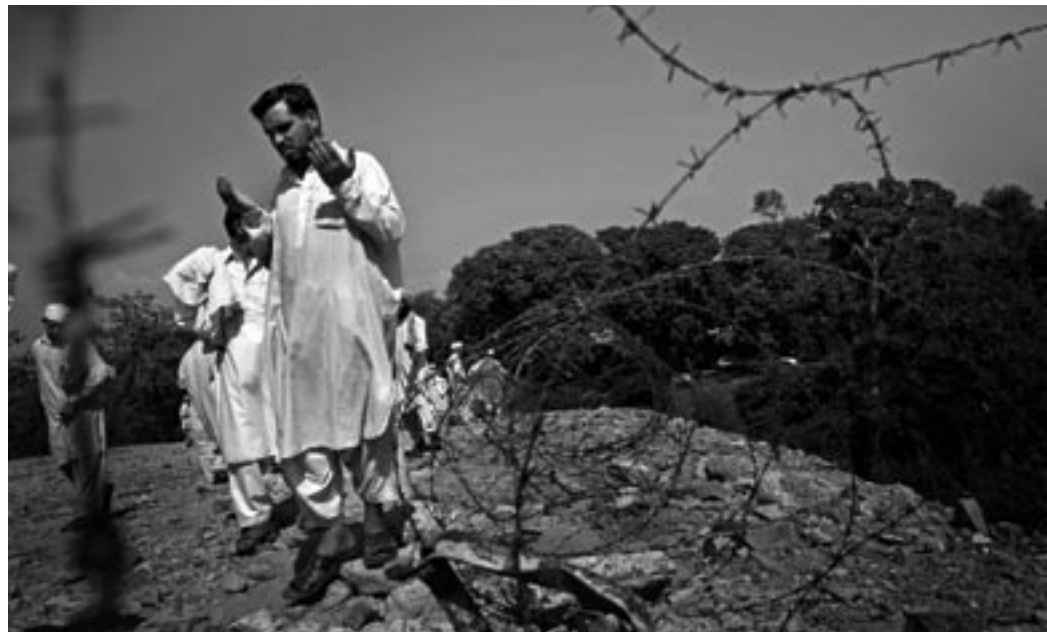
A man offers a prayer on the rubble of the Jamia Hafsia, the girls' madrassa which was affiliated with the Red Mosque, following Friday prayers at the mosque in Islamabad, Pakistan. The Red Mosque was reopened several months after the violent standoff between Pakistani forces and militant Islamic students.

“The call to prayer echoed through the cities five times a day, often waking me in the morning and soothing me to sleep at night.”