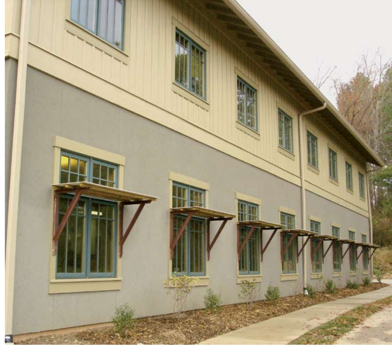
Light shelves reflect sunlight onto interior ceilings to illuminate the offices without glare.