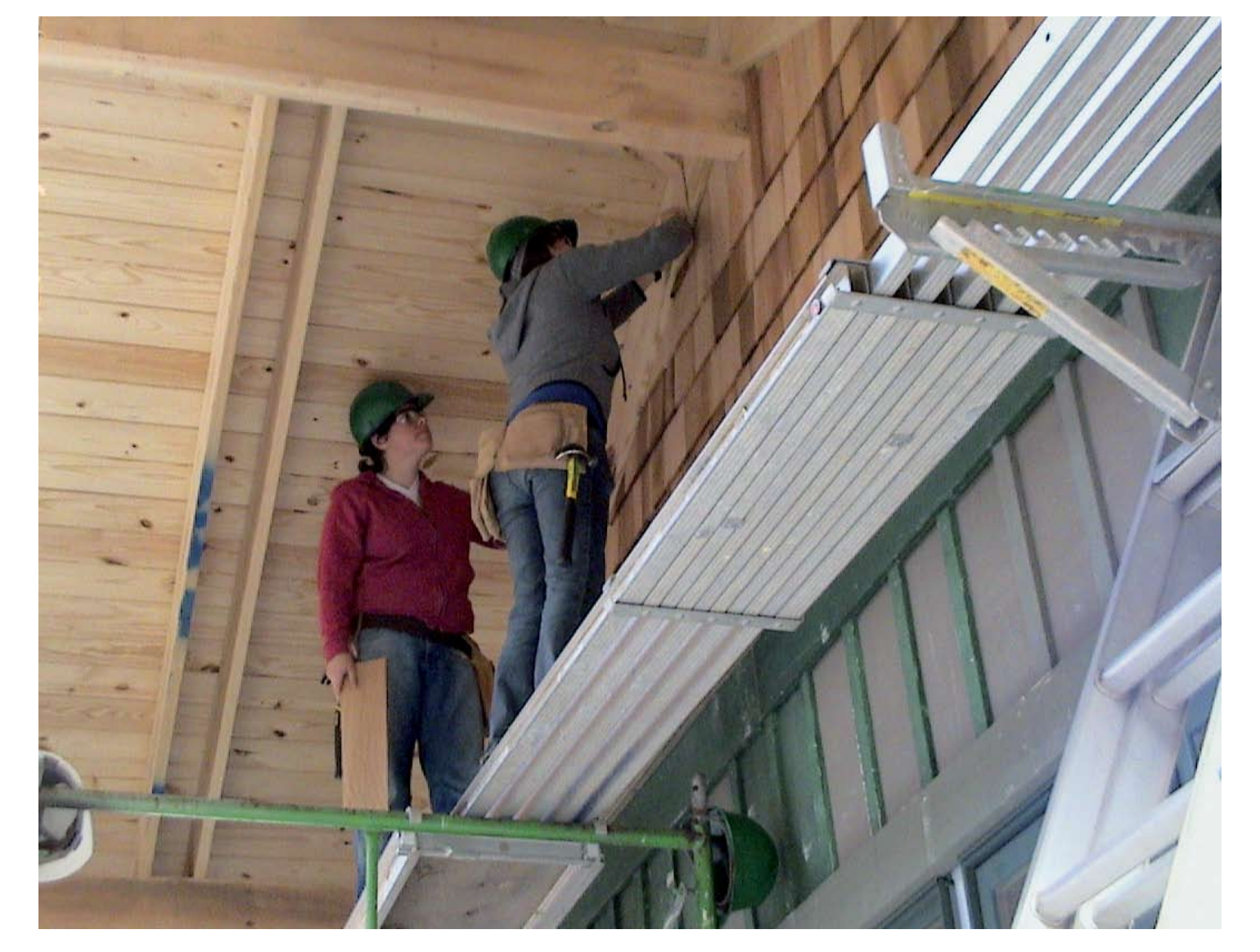
All of the wood siding comes from Warren Wilson forests, sustainably harvested and milled by the Forestry Crew.