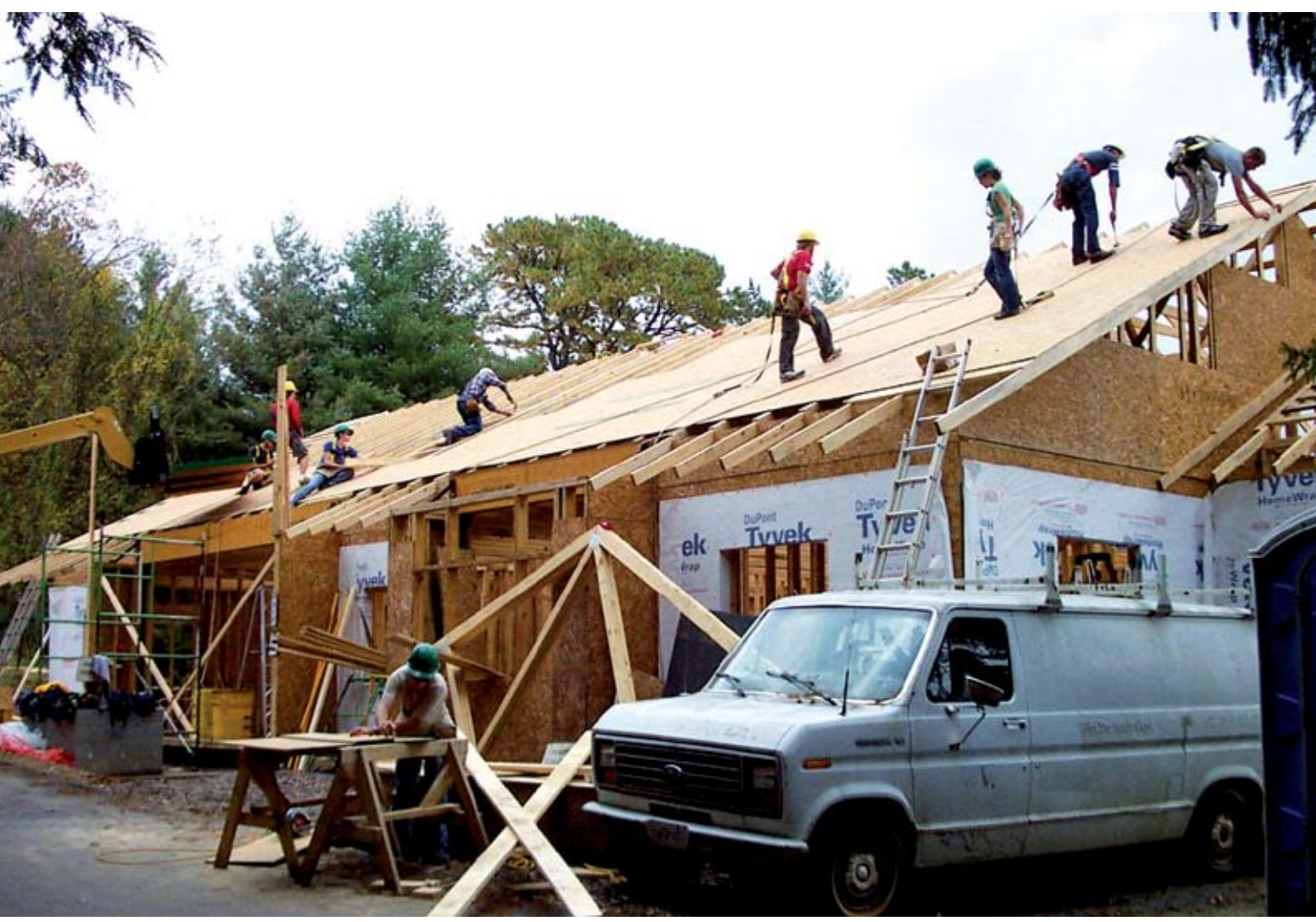
Facilities Management Crews at work include Building Services, Purchasing, Forestry, Campus Support, Carpentry, Plumbing, Electric, HVAC, Paint, Autoshop, Locksmith, and Housekeeping—the ultimate in hands-on learning.