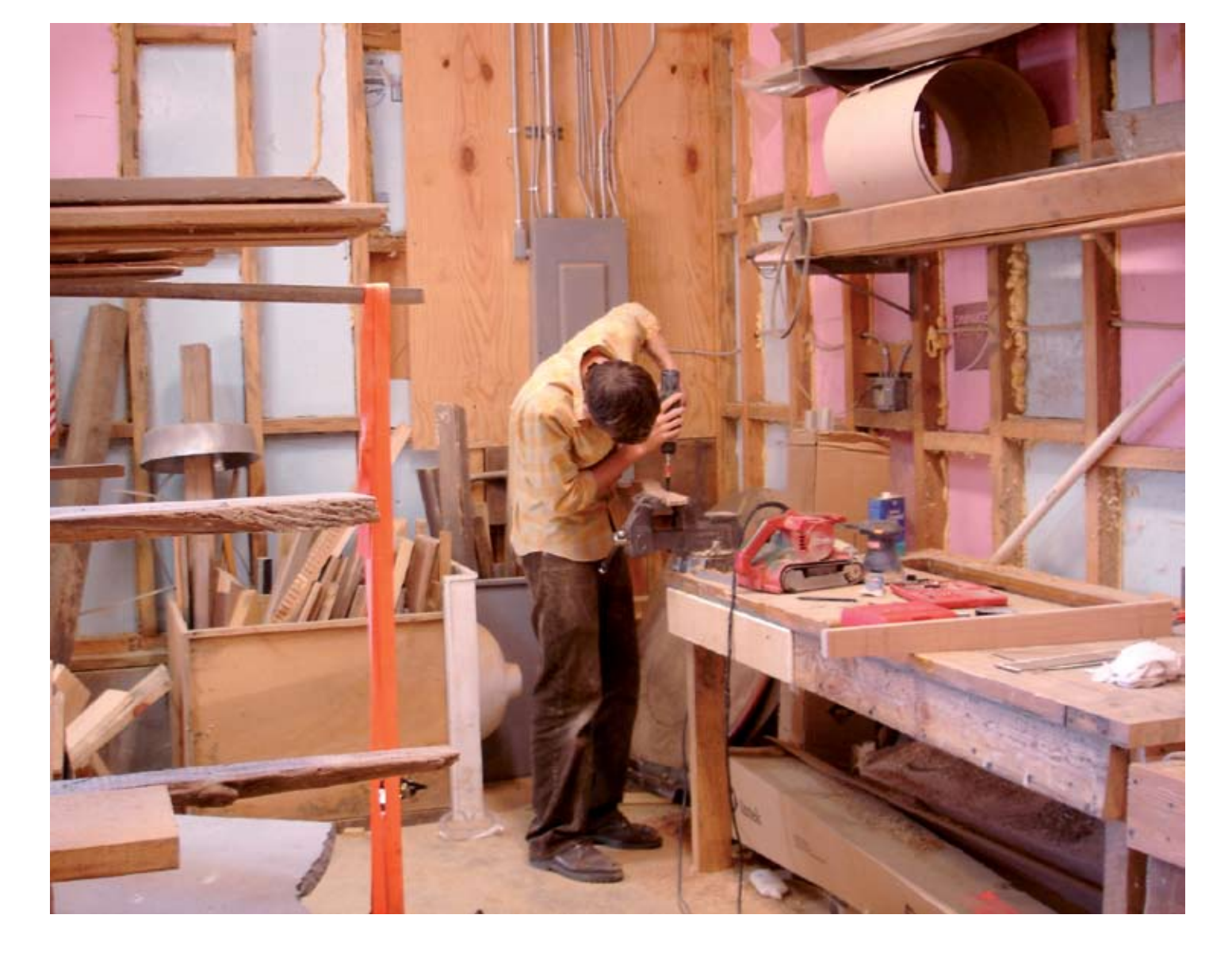
The Recycling Woodshop prepares scrap lumber for community use.