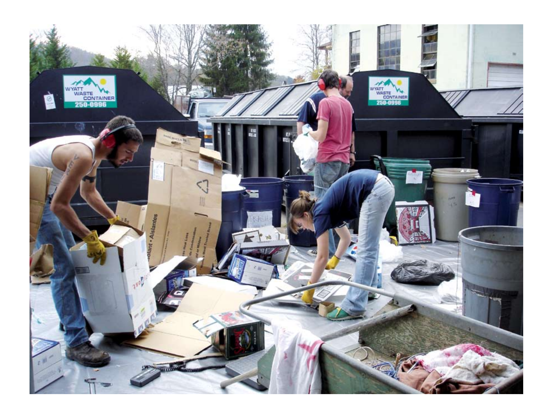
The Recycling Crew conducts "garbology studies" to pinpoint trash that should have been recycled.

A recycling and solid waste management program was the first organized sustainability initiative on campus. One student began the effort in 1982, and five years later, following a plan created by an environmental policy class, the Recycling Crew set up and operated the first drop-off recycling center in Buncombe County. The Crew now deals with over 500 tons of recyclables and trash annually, and reclaims more than 25 different types of materials. The National Wildlife Federation named Warren Wilson "a leading school in several areas, in particular recycling and reducing waste."