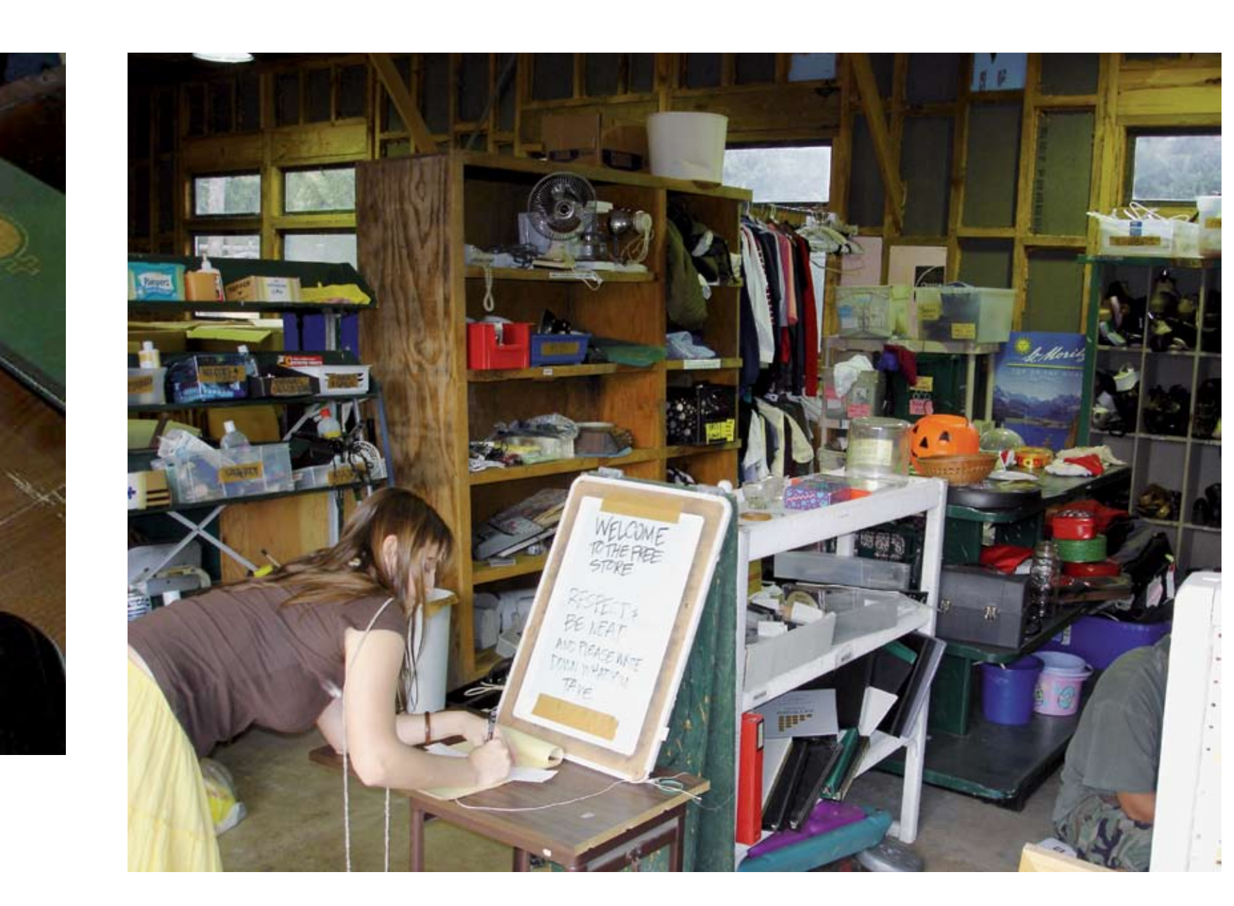
The Free Store supports the philosophy, "Don't buy new-reuse!"